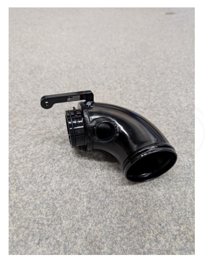
Step 5 (Only when installing do88 3" turbo inlet pipe)

Install the included O-ring on the turbo inlet elbow and install it in the car the opposite way the OE turbo inlet elbow came out and secure it with the OE screw.