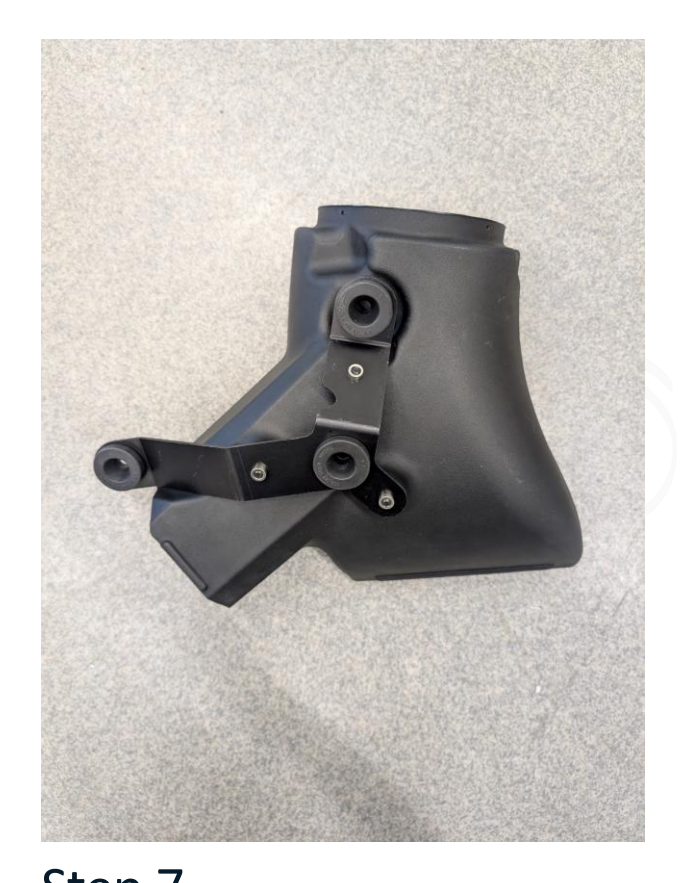
Step 7 Mount the bracket to the air filter housing with included M6x12 Allen 4 screws.