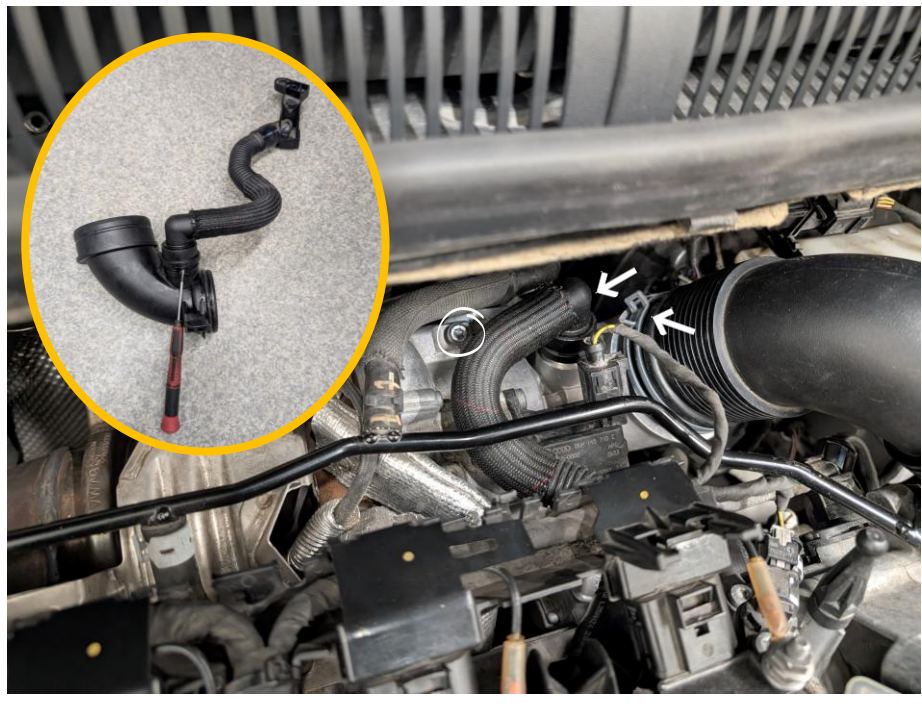
Step 3 (Only when installing do88 3" turbo inlet pipe)